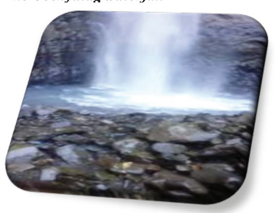
The Gochyatag waterfall

One of the other famous waterfalls of the research area is Gochyatag waterfall located near Ilisu village of Gakh region, on Hamamchay river. The waterfall, which is about 35 meters high and 1 meter wide, is abundant throughout the year. In winter, it becomes even more attractive by closing the ice. Gochyatag is the name of a nearby mountain, and Sugovushan is the name given to another small river that joins a nearby river.