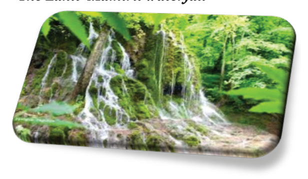
The Lakit-Mamirli waterfall

It is located at a height of 550 m above sea level in the depth of a dense forest on the left bank of the river of the same name near the village of Lakit-Kotuklu, 3–4 km from Gakh region. The waterfall is 15 m high and 30 m wide. Because of the dense forest around it, it never gets sunlight and is always cool. The waterfall was registered as the Gakh Natural Monument by the decision of the Cabinet of Ministers of the Republic of Azerbaijan Nº 190 dated August 5, 2006 and is protected by the state (Sputnik, 2016).