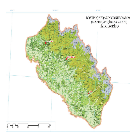
Picture 1. Physical map the southern slope of the greater Caucasus (Mazimchay and Shinchay corridor)