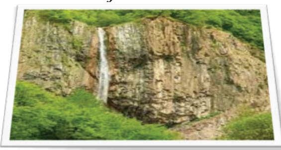
The Ilisu waterfall

It is also located in the village of Ilisu, Gakh region, at an altitude of 1,200 meters above sea level, known as Ram-rama. Locals consider the 25-meter-high waterfall, located in the Ilisu State Reserve, a hidden treasure. Located 2 km from Ilisu village in the direction of Hamamchay gorge, the waterfall is clear and is one of the interesting natural exotic objects that attract tourists to the region.